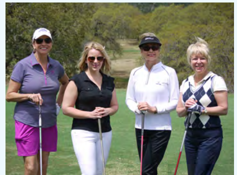
Panther Scramble 2014

TMI – The Episcopal School of Texas admits students of any race, color and national or ethnic origin.