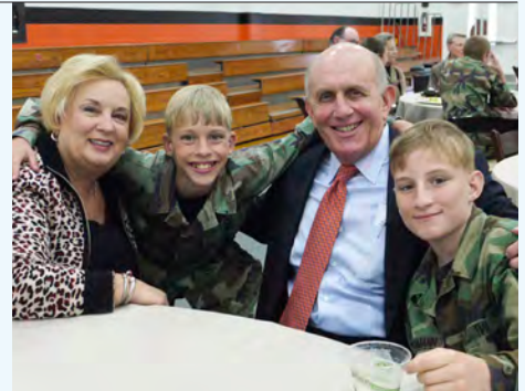
Grandparents Day 2013