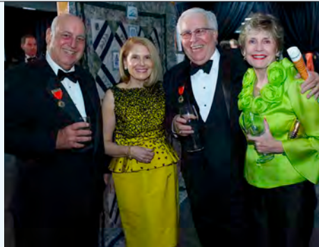
Stars Over TMI 2013