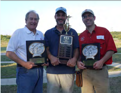
Alumni Clay Shoot 2013