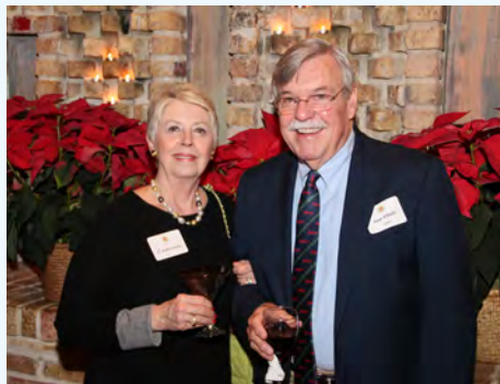
Alumni Holiday Party 2013